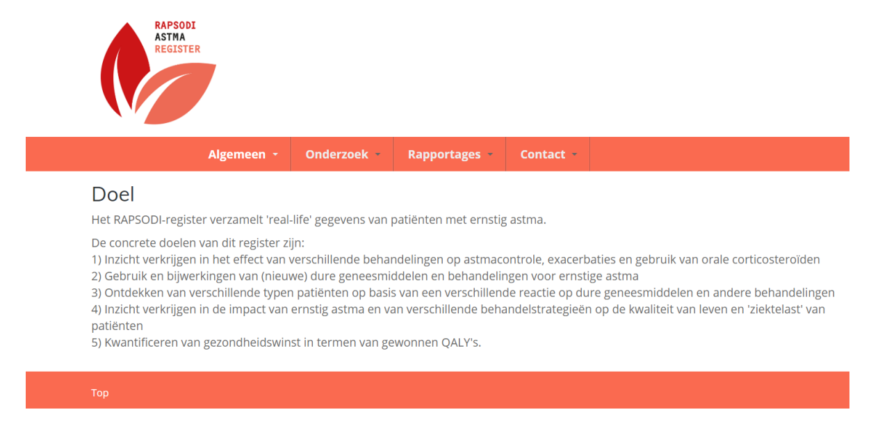
Fig. 2. Screenshot from the RAPSODI Register website (d.d. 17/6/2020)

We are very happy to announce that the RAPSODI registry website has been launched. There you can find the most relevant information regarding our registry, including publications, documents and milestones. You can access the website using the link: <a href="https://www.rapsodiregister.nl/">https://www.rapsodiregister.nl/</a>