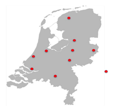
Table 1. Inclusion of patients per site (total number of patients= 613)